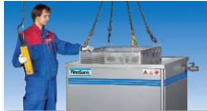
Basket loads up to 150 kg

Matching rinse tanks are available for both standard and custom sizes.